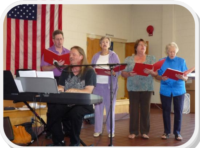
What a joy to have the Choir singing in worship!