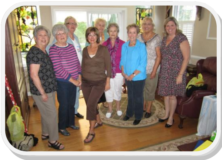
The Church Ladies at their September meeting.

Save the date: The Church Ladies plan to go to see the Newark Boys Chorus in Manasquan on December 12th at 10:00AM with lunch to follow. Please let Joan Mallison know if you are interested!